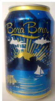
Hinano 6-can Island set Brasserie de Tahiti, Puna'aula, Tahiti, French Polynesia