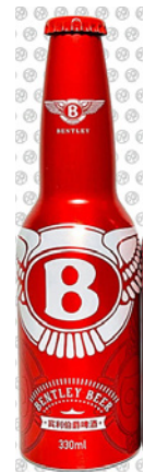
Bentley Beer Bentley Beer Limited, Hong Kong