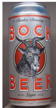
Bunker Brewing Bock Beer Bunker Brewing Co. Portland, ME