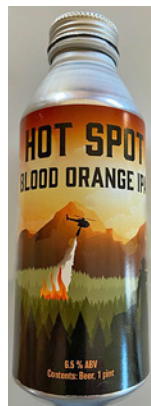
Hot Spot Blood Orange IPA Philipsburg Brewing Co., Philipsburg, MT